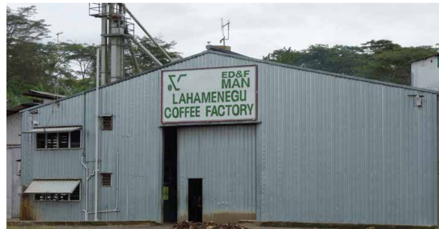
3 The Constitutional Planning Committee were against the concept of "ownership"

Because of these dangers the Constitutional Planning Committee (CPC) favored 'registration' only in very particular circumstances, where it would allow customary landowners to take back control of alienated plantation land or collectively organise and work their own land.